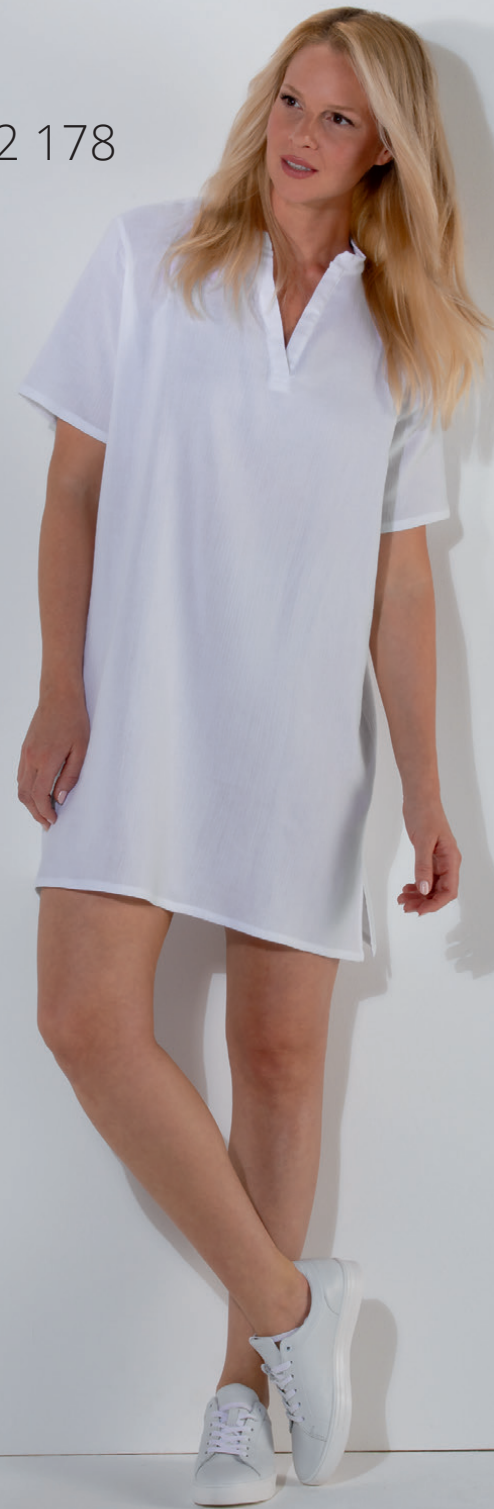
Design 10312 178 Tunic "Sina"