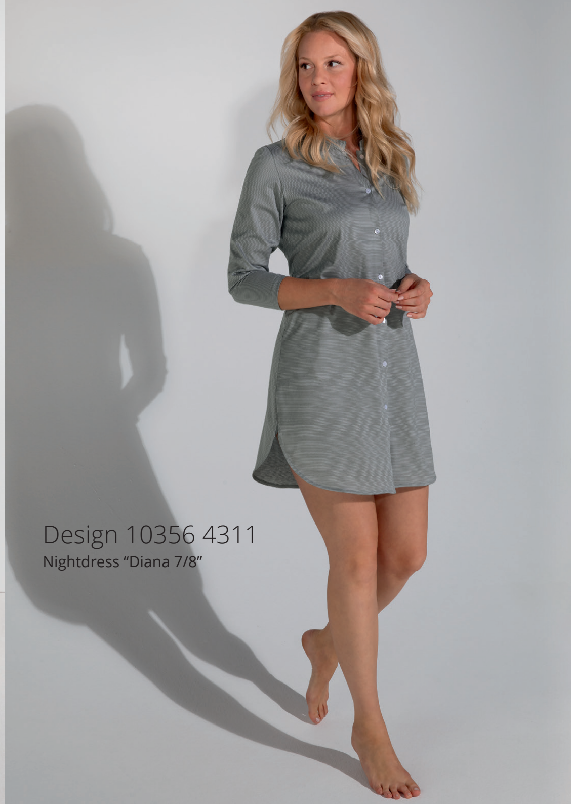
Design 10356 4311 Nightdress "Diana 7/8"