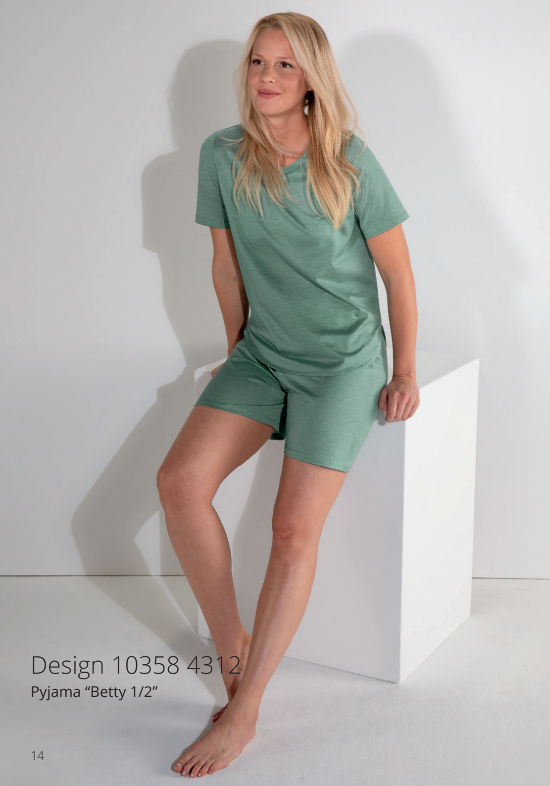
Design 10358 4312 Pyjama "Betty 1/2"