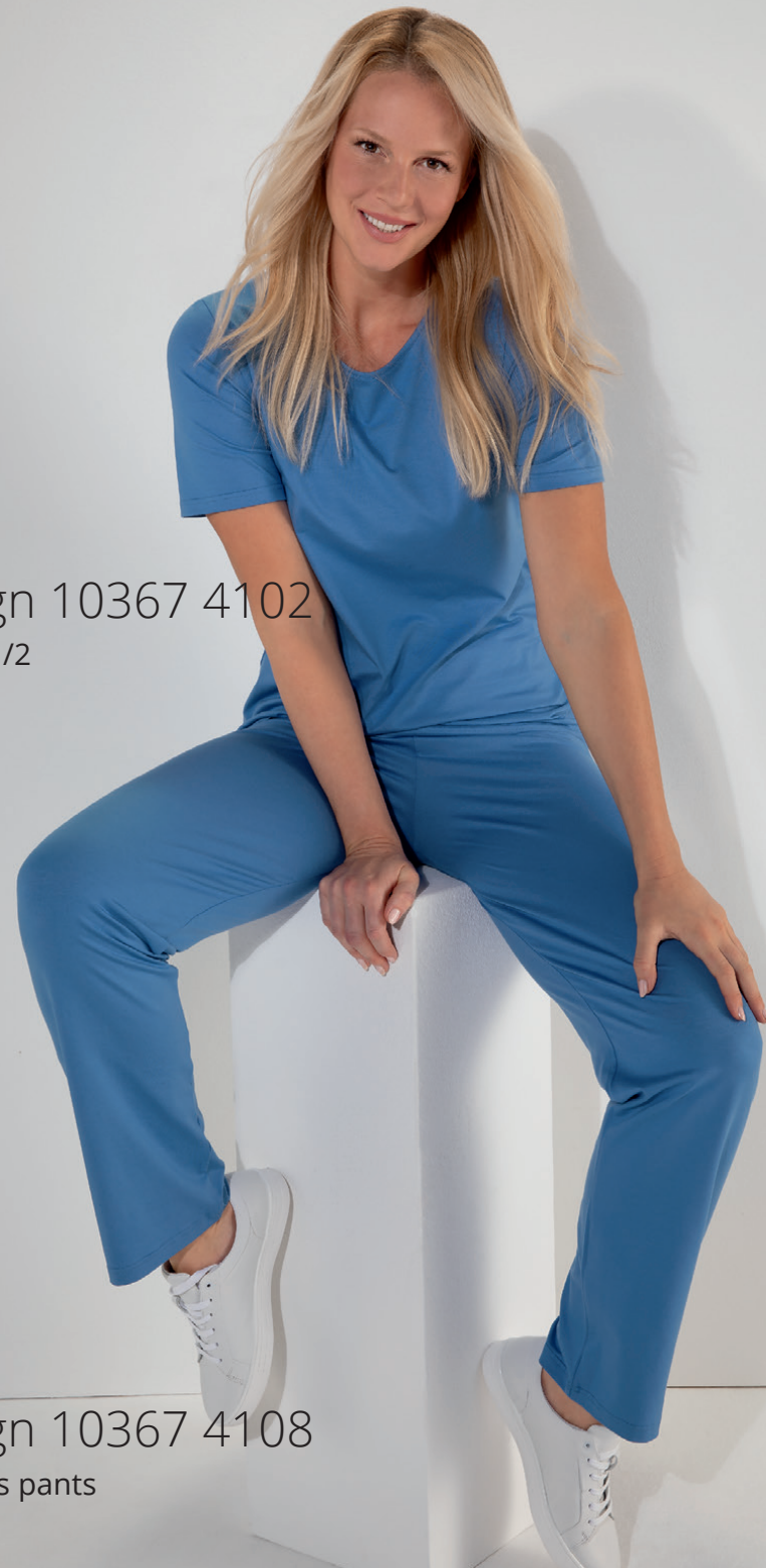
Design 10367 4102 T-Shirt 1/2