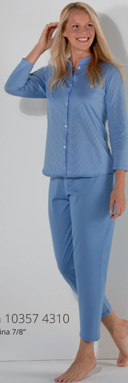
Design 10357 4310 Pyjama "Dina 7/8"