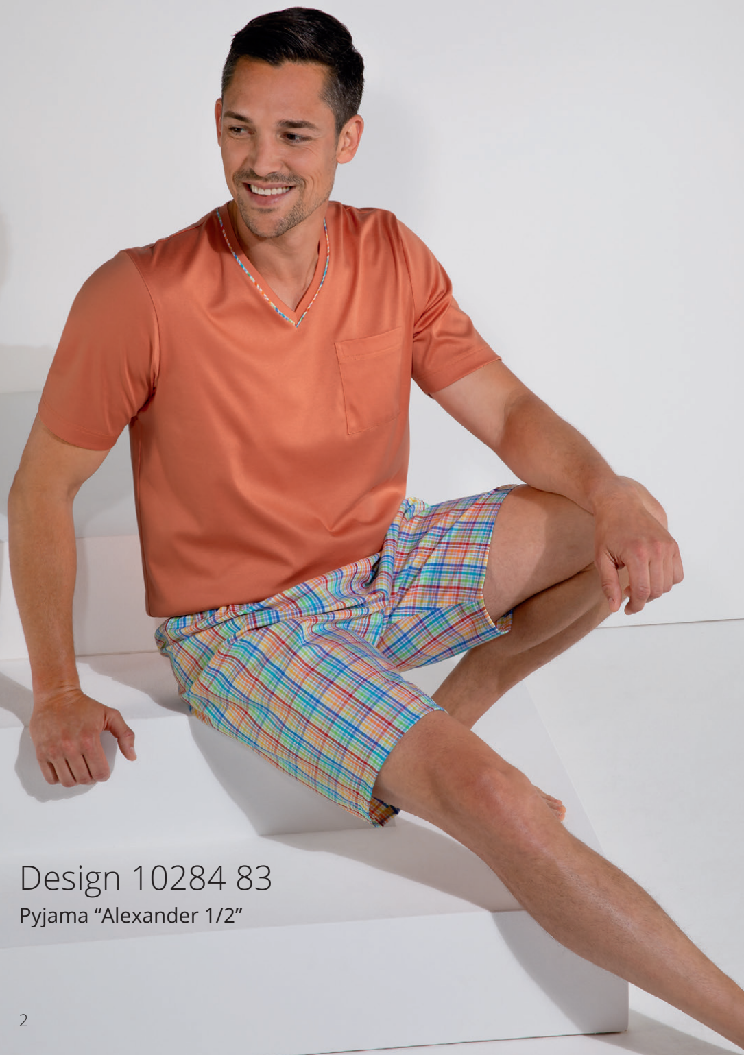
Design 10284 83 Pyjama "Alexander 1/2"