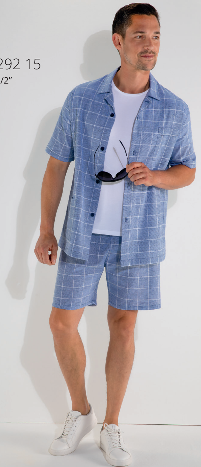
Design 10292 15 Pyjama "Marco 1/2"