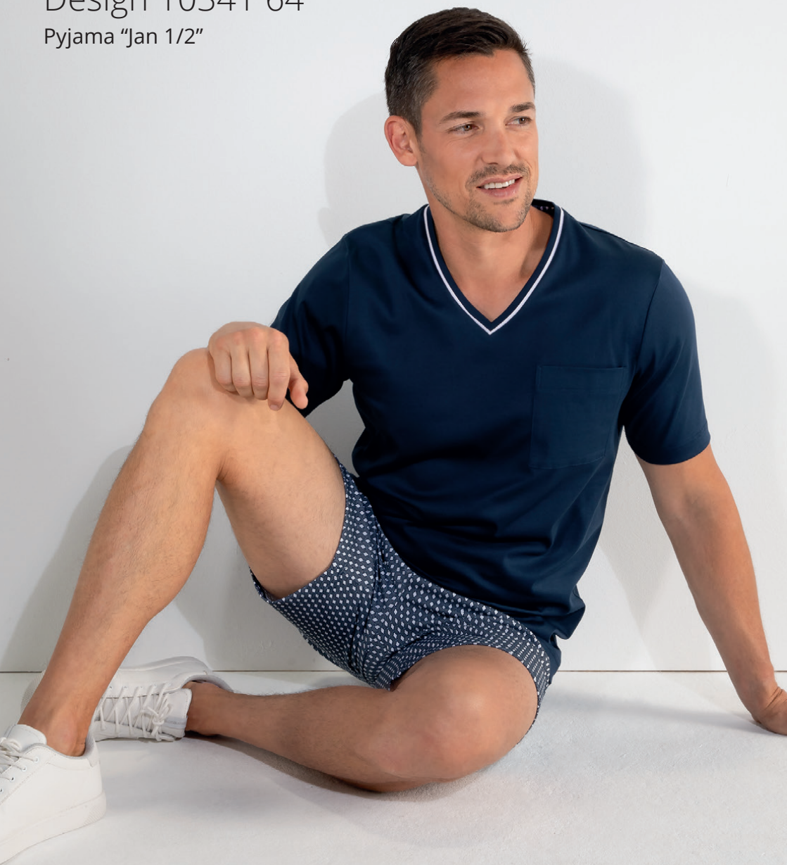
Design 10341 64 Pyjama "Jan 1/2"