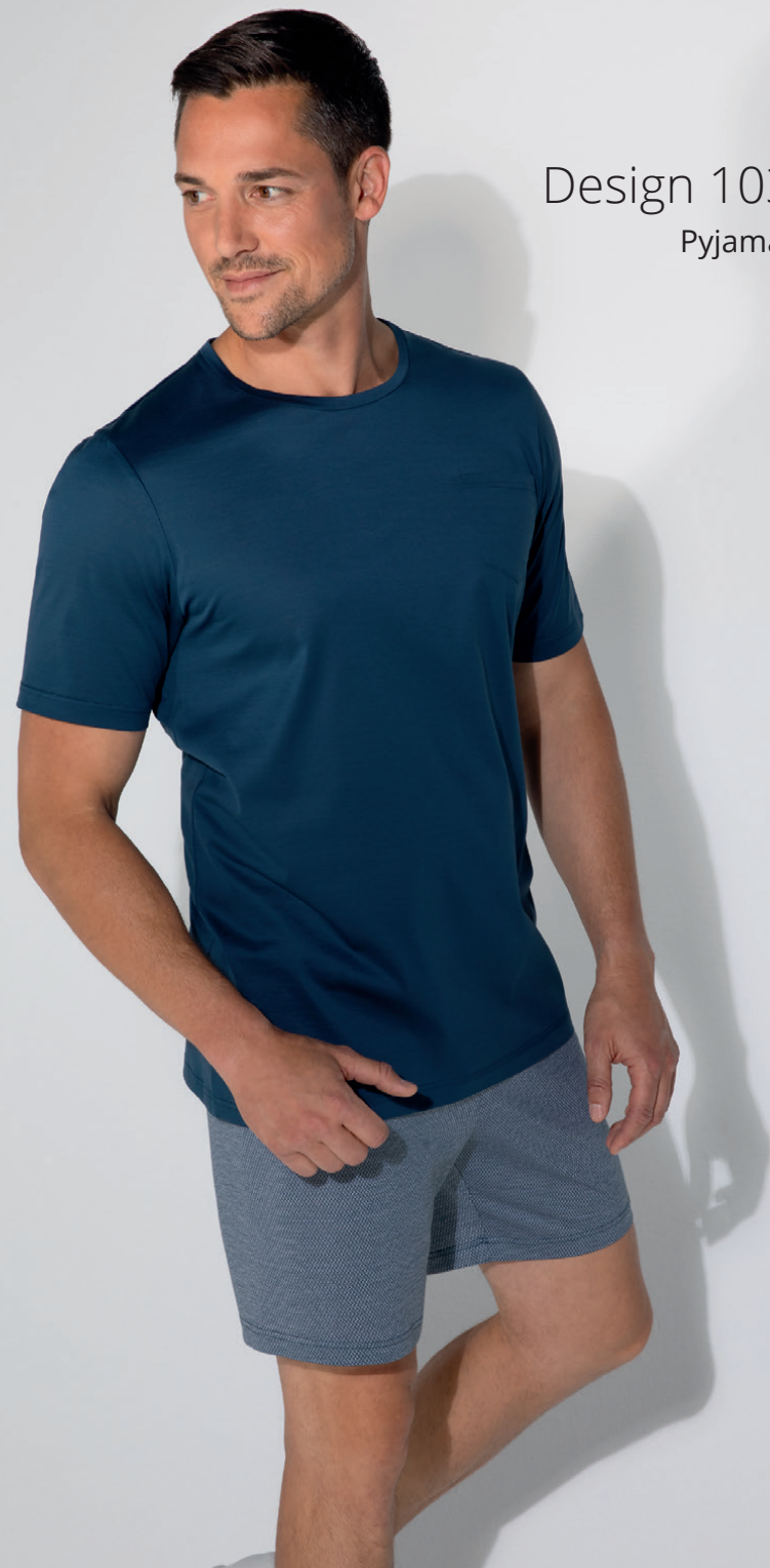
Design 10353 68 Pyjama "Tim 1/2"